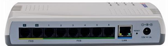
IP PBX Slican ITS