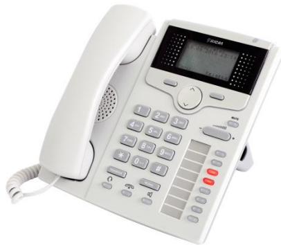
CTS-220.CL / 220.IP