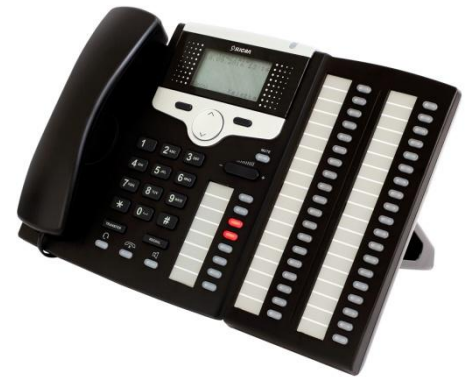
CTS-220.CL / 220.IP with CTS-338 console

Phone profile is created and stored in the Slican PBX memory. The phone can be used immediately after power connection, without complicated and time-consuming programming. Programmable BLF buttons allow you to create individual functions, services or create a list of handy contacts. For your comfort and to increase number of programmable keys, you may connect to each Slican CTS-220 system phone series up to 4 CTS-338 consoles. With consoles you may program up to 162 buttons.